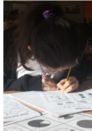
Fractions Team Osprey!