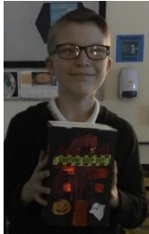
Spooky Houses Team Falcon!